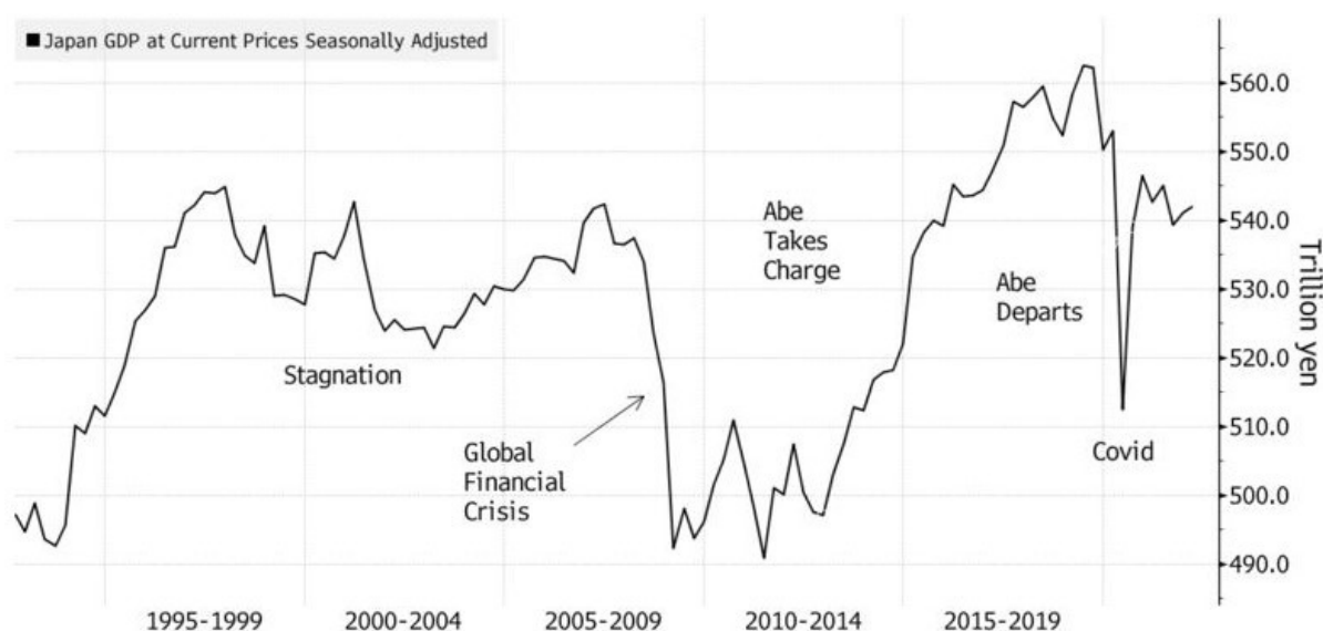
Fig.2. The transformation of Japan's economy under prime minister Shinzo Abe

near-perfect, privately-run public transport system. Importantly, for a long time it also maintained a culture of zero inflation.